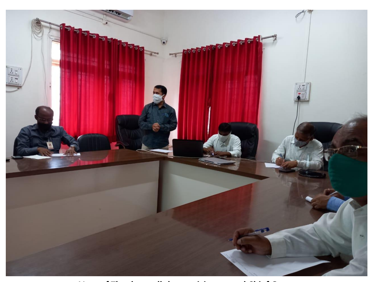
Vote of Thanks to all the participants and Chief Guest